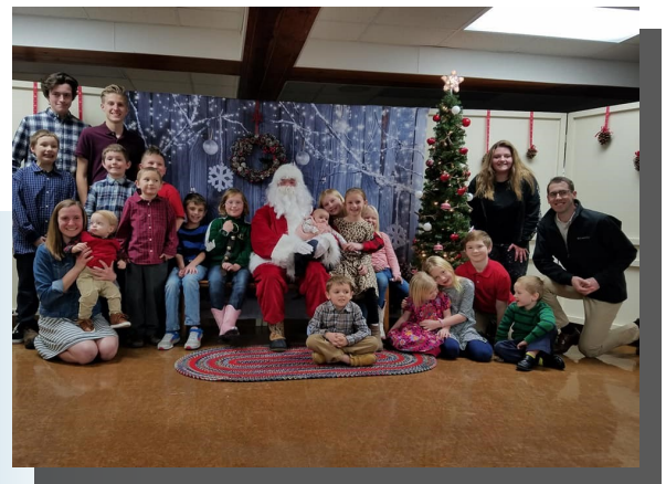
(Top) Santa stopped in for a visit with the children of Saint Patrick's this past weekend

It's not really Christmas though until the first Advent service in the school lobby with the students circled around the Blessed Virgin.