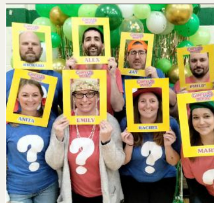
Winners of Best Costume