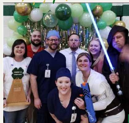
2025 Trivia Night Winners