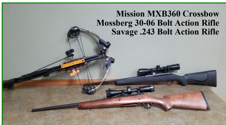
Mission MXB360 Crossbow Mossberg 30-06 Bolt Action Rifle Savage .243 Bolt Action Rifle

However our other raffle, the Hunter's Raffle is still underway. On the April 17/18 weekend Masses we will be putting baskets out with separate envelopes containing $20 of raffle tickets for the Hunter's Raffle. We need your Hunters' Raffle tickets back not later than Tuesday April 20th 4pm—and if you are returning stubs/monies that day, best to drop those off in the parish office by that time.