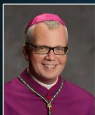
Bishop Donald Hying

St. Cecilia Parish 603 Oak Street Wisconsin Dells, WI 8:00am - 4:00pm