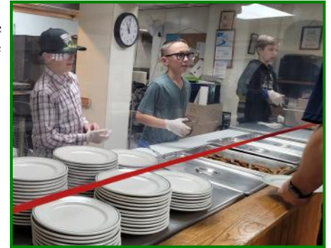
7th grade students helping at the December 19, 2021 Pancake breakfast

The hallmark of each breakfast is the students (and parents of those students) helping to serve the breakfast.