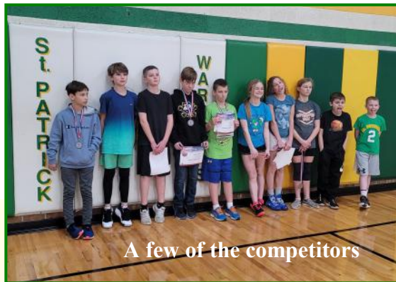
A few of the competitors

noon with the competition beginning at 1pm. Winners at the district will go on to compete against children from all over the Diocese of La Crosse who have won their district competitions. That date is tentatively scheduled for Sunday April 24th.