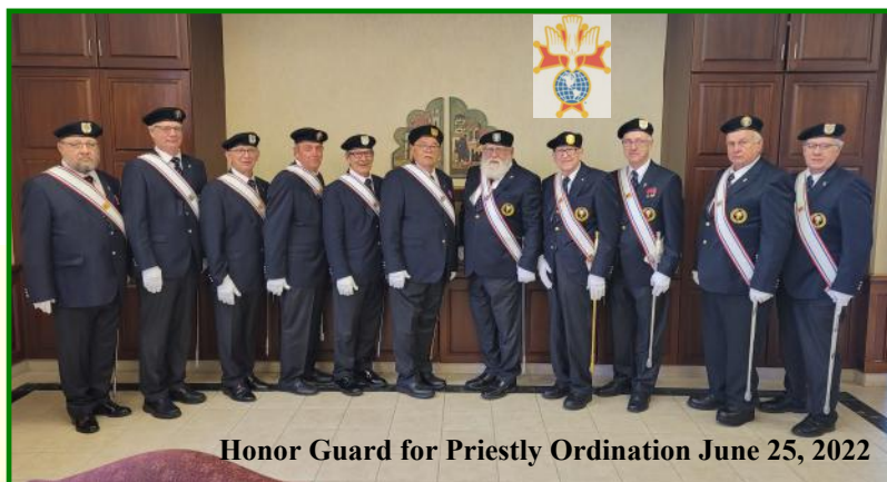
Honor Guard for Priestly Ordination June 25, 2022

with them. He attended St. John Vianney Seminary in St. Paul and St. Francis de Sales Seminary in Milwaukee. His first priestly assignment is as Associate Pastor of Our Lady Queen of Heaven Parish in Wisconsin Rapids.