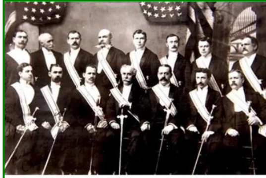
First Exemplification Feb 22, 1900

Our council belongs to the Fr. Francis Heindl Assembly 1902 based out of Tomah.