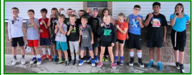
1st thru 3rd place winners shown above (12 year old boys not in photo)

We had an exceptionally large group of young competitors at our Tuesday, September 26, 2023 Punt Pass and Kick contest. I counted 64 boys and girls competing in age and boy/girl categories from age 8 to