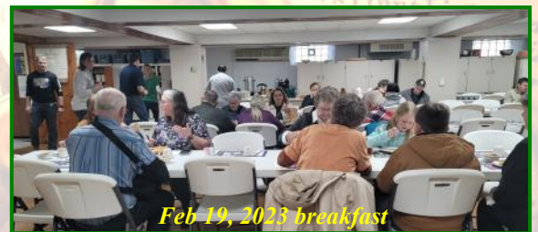
Feb 19, 2023 breakfast

Each year the Knights of Columbus sponsor 4 pancake breakfasts. Each date, the proceeds go to one of the St. Patrick School classes. We start with the 8th grade class (Nov 12th), followed by the 7th grade (Dec 10th—with Santa this year), 6th grade (Jan 21st), and 5th grade (Feb 18th). However we expect the students in those grades with each respective breakfast to help serve. It is most beneficial for them to learn about service. Usually the teacher of the grade helps, along with parents. The charge for our breakfasts is a free will offering. In addition to the lesson of service learned by students, the