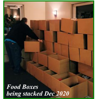
Food Boxes being stacked Dec 2020

On Saturday December 16th from 9 to 11 am, the boxes will then distributed. The location for both the preparation on Friday and the distribution on Saturday will be the Bible Baptist Church, located at 148 Grayside Avenue in Mauston. Remember the Gospel's admonition: Feed the Hungry!