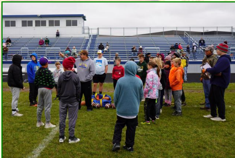
Explanation of the Punt Pass Kick Contest to boy and girl contestants at Diocesan Competition

The State Contest was held a week later on Saturday October 28 in De Pere. It was a rather cold day in De Pere. However the energy of the contestants proved to be greater than the cold, and the boys and girls excelled in their competitiveness. Individual results had not been published at the time of our publication.