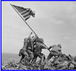
The raising of the flag on Iwo Jima in WWII

Steve Hesprich, Committee Chair - "God Country Flag" patriotic program. A continuing series: An idea to renew our faith in a nation "conceived in liberty and dedicated to the proposition that all men are created equal"