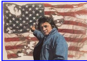
From the cover of the spoken-word tribute of Johnny Cash entitled "Ragged Old Flag" https://genius.com/Johnny-cash-ragged-old-flag-lyrics

Johnny Cash does a wonderful tribute that