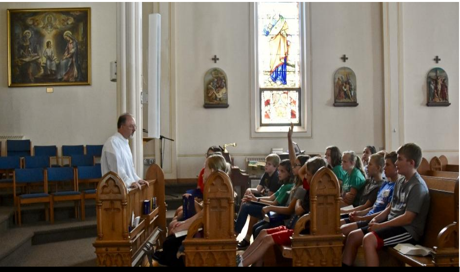
On Thursday all ages during their Activity time had a lesson on Adoration and then were able to spend some time with Jesus.