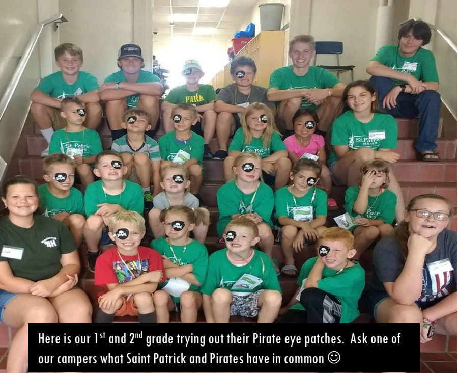
Here is our 1 st and 2 nd grade trying out their Pirate eye patches. Ask one of our campers what Saint Patrick and Pirates have in common 😊

Every day we had an Arts and Crafts time where all the different campers made a craft to go along with the lesson .