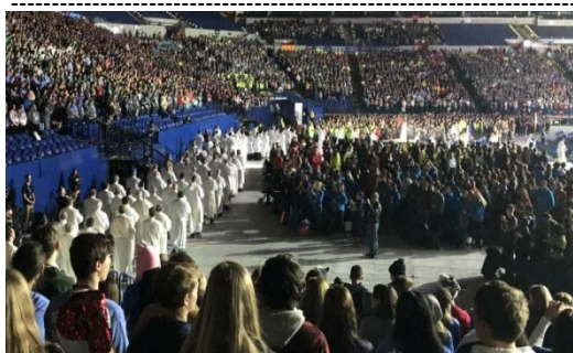
Part of the procession of priests that were there for the Mass on Saturday Night.