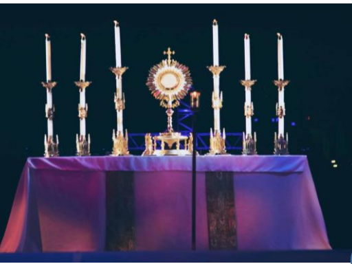
"Adoration was my favorite and was powerful"

"I really enjoyed the workshops and talking to everyone!"