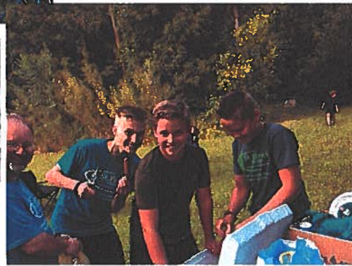
July brought our annual Frisbee and Fire Night at Kiwanis Park where kids and their parents enjoyed some fun with a fire, hotdogs, and Disc Golf!

like to see something added or want to see a certain book study, please send me an email. I would love to add it to the New Year's calendar.