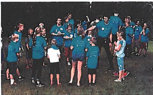
October was our Confirmation Retreat at Holy Hill