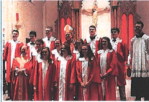
May brought Confirmation to Saint Patrick's where 12 from our Parish were Confirmed.

July we had our Chicken Parish Picnic. 125 parishioners got together and ate, all while enjoying some beautiful music and some great conversation! August we started back with Religious Ed. We currently have 7 Catechists and 6 parishioners for our RCIA Team. September started the "That Man is You." This is a program geared to men on how to be a better faith filled husband, father, man. On average there has been 6-7 men at the Friday morning meetings. Please watch the bulletin for their next meeting and time! And this December we had 13 that took part in our Advent Retreat. ***This has just been a sampling of some of the events and programs being offered here at our Parish for Adults. If you haven't already, please take some time in prayer and find out where God might be calling you in this New Year. We are always willing to hear about new ideas as well! If you would