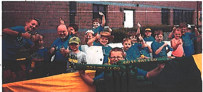
In August we had our Vacation Bible School and float in the Mauston Parade.

like to see something added or want to see a certain book study, please send me an email. I would love to add it to the New Year's calendar.