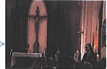
In February two sisters from the Mater Redemptoris House of Formation in La Crosse came for the Girl's Vocation Night.

In March the Confirmation students sent letters to a Florida Youth Group, along with prayer shawls for those who were affected by a school shooting.