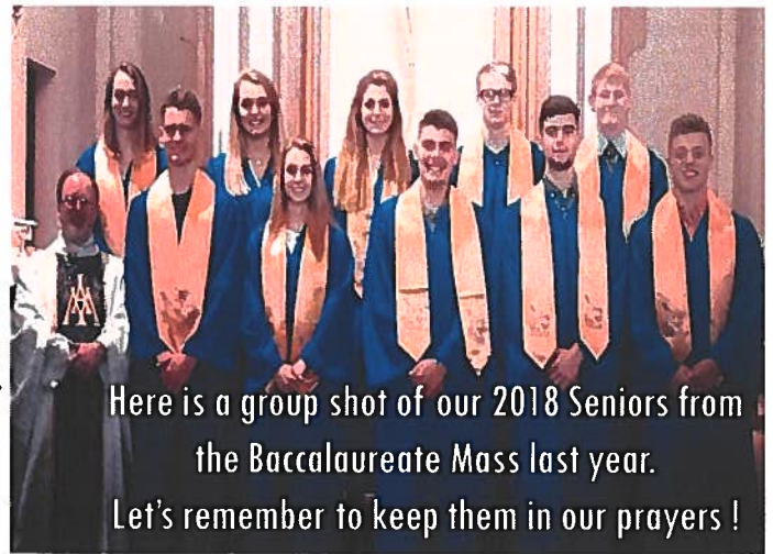
Here is a group shot of our 2018 Seniors from the Baccalaureate Mass last year. Let's remember to keep them in our prayers!