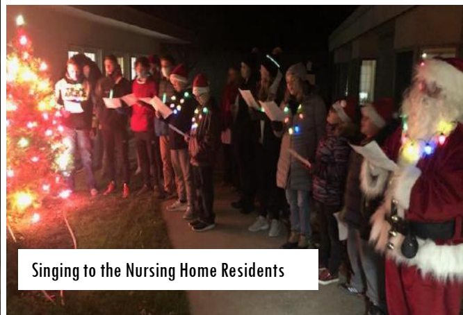
Singing to the Nursing Home Residents